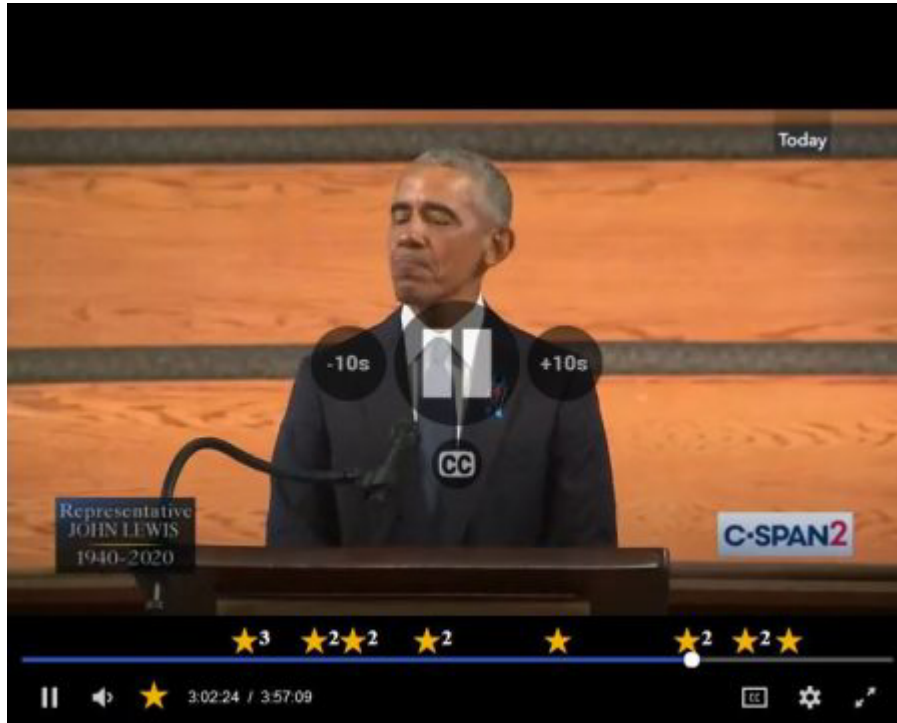
Barack Obama speaks at funeral of Rep. John Lewis, July 30, 2020.

(Aug. 1, 2020) — Two well-known black Americans have died. One – John Lewis – was a Congressman; the other – Herman Cain – was a successful businessman. While the Congressman was lionized by the mainstream media, the other – even before his worldly body was cold – was vilified because he supported President Trump and attended a Trump rally “mask-less.” Never let a crisis go to waste.